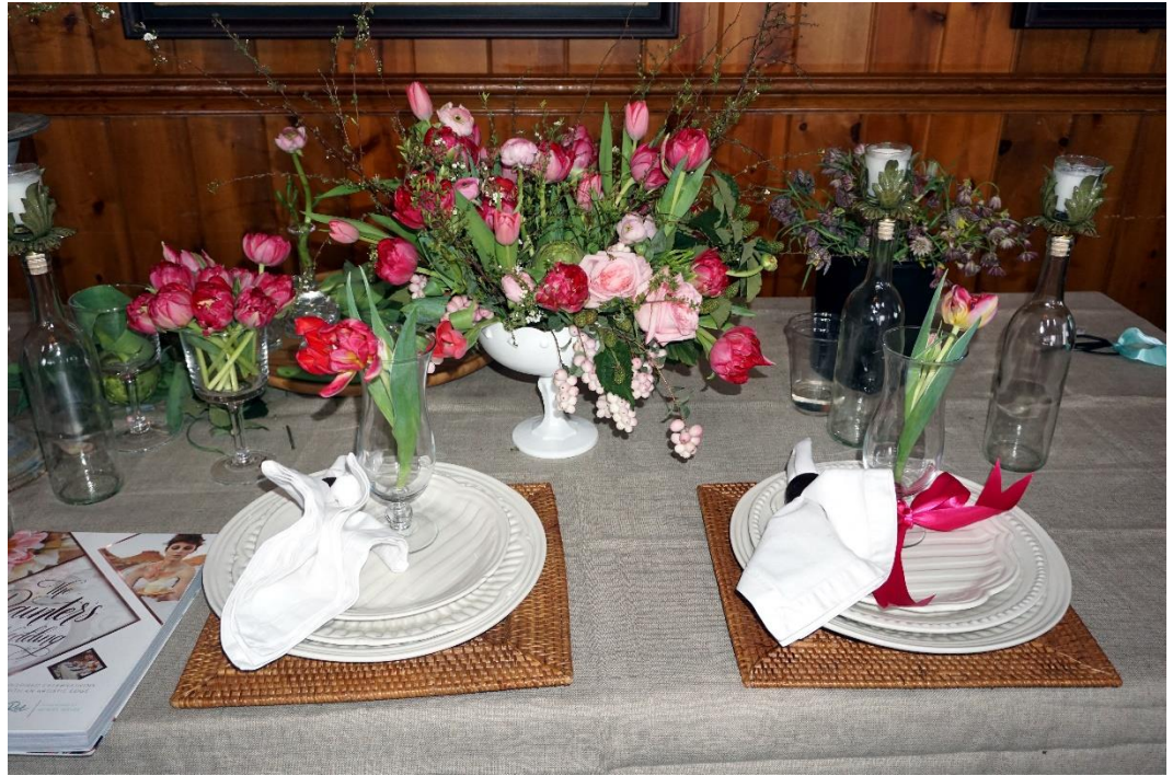
Above, Garden Party Table Setting for 2