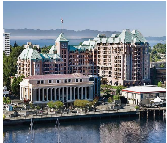
The Hotel Grand Pacific

We will be staying four nights at The Hotel Grand Pacific, a 4-star hotel located on Victoria’s Inner Harbor. This full-service hotel features three dining options and a fully equipped Fitness Facility, including a swimming pool. Tonight’s dinner will be at the one of hotel’s restaurants.