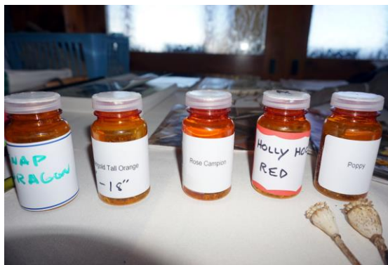
Our speaker and his plant seeds!