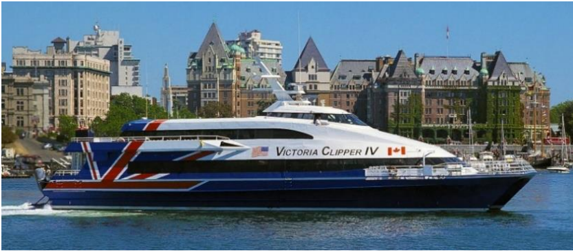
Victoria Clipper arriving in Victoria, BC